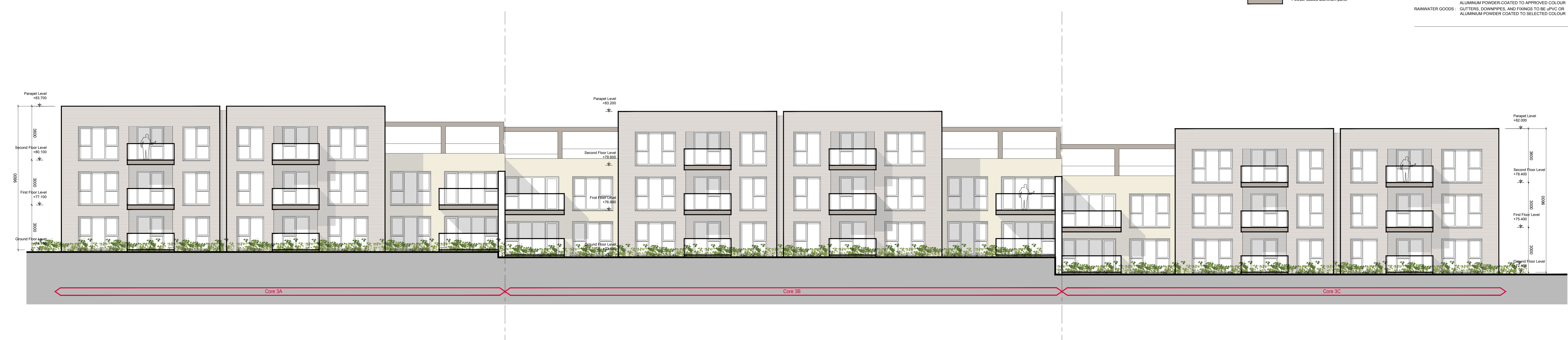
BLOCK 3 ELEVATION 01- FACING SPINE ROAD